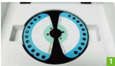
Put in the disk